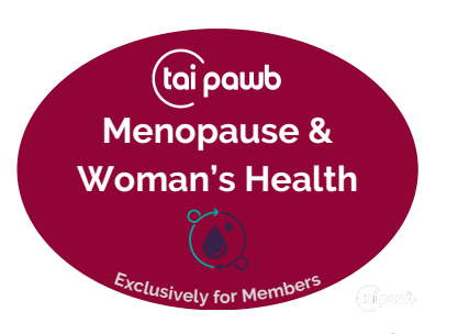
Menopause & Woman's Health events (2pa)