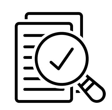
Equality Impact Assessment Workshop (1pa)