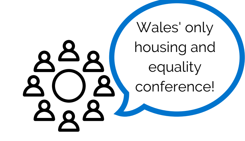
20% discount for annual conference