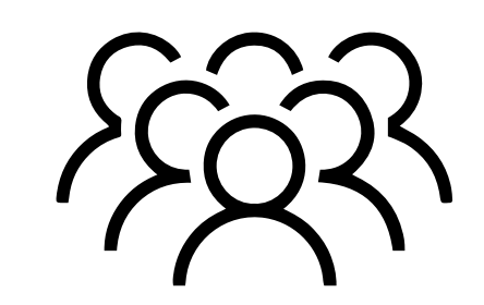
Tai Pawb attendance at your equality working group